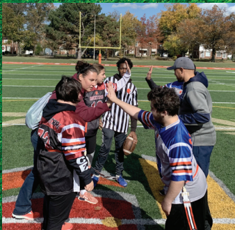
Special Olympics Unified Champion Schools