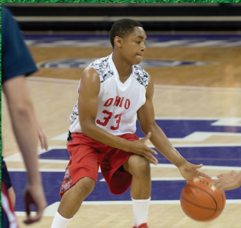
Special Olympics Sports