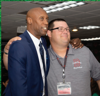
Special Olympics Athlete Leadership