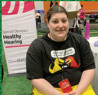
Special Olympics Healthy Athletes