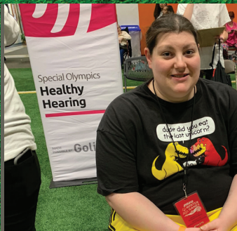
Special Olympics Healthy Athletes