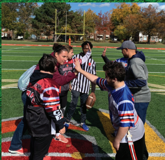
Special Olympics Unified Champion Schools