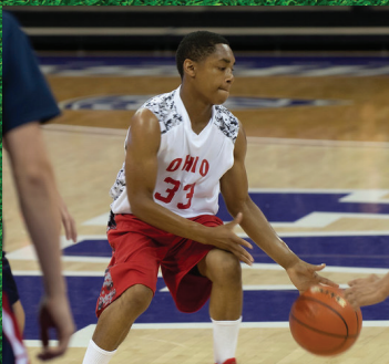
Special Olympics Sports